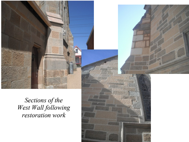
Sections of the West Wall following restoration work