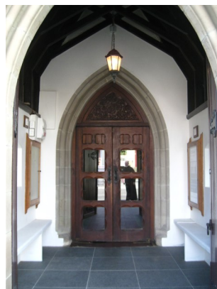
The porch, showing the new granite tiles, re-finished ceiling and beams and the new light fitting.

re-placed. The South Hobart Progress Association has been a generous supporter of our desire to replace the crosses. Two have now been replaced: a third is to go above the east windows and a fourth above the windows at the west end of the Kennerley aisle.