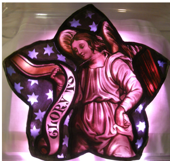
This little angel was the first window to be removed for restoration

The All Saints Church South Hobart Conservation of Heritage Stained Glass is supported through funding from the Australian Government's program Your Community Heritage